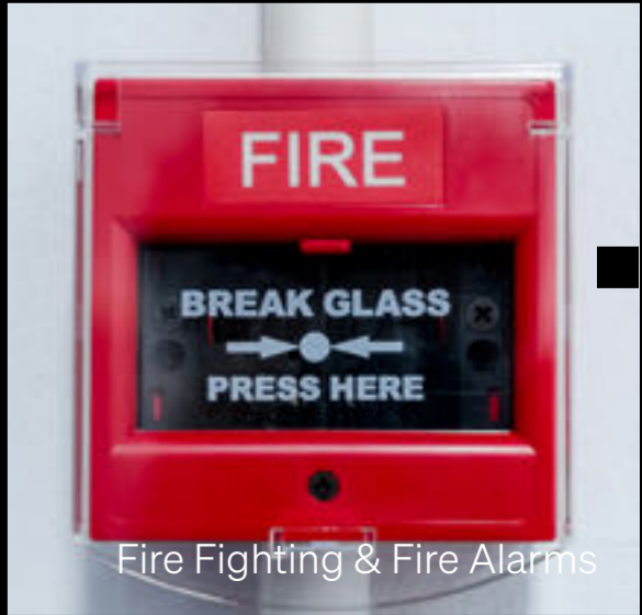
Fire Fighting & Fire Alarms