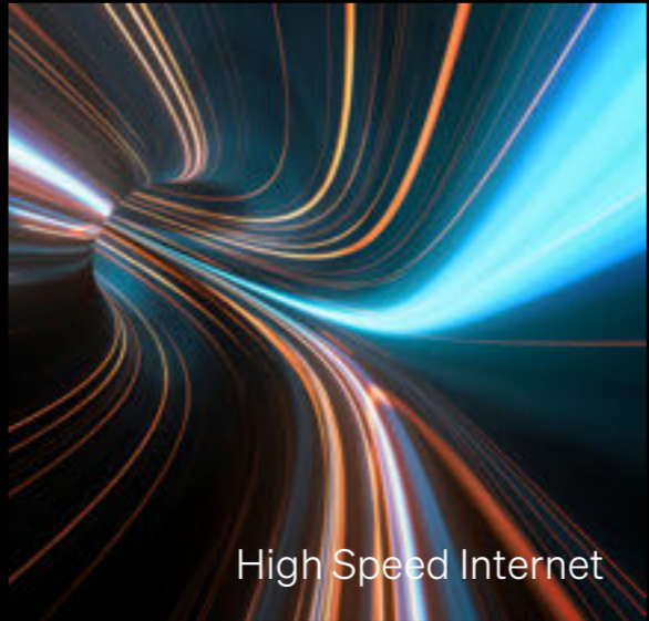
High Speed Internet