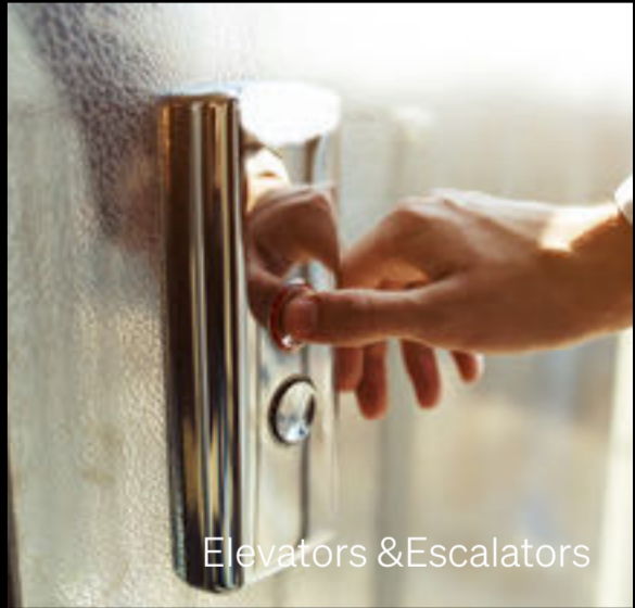
Elevators & Escalators