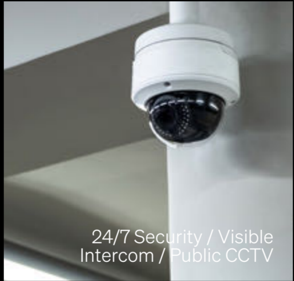
24/7 Security / Visible Intercom / Public CCTV